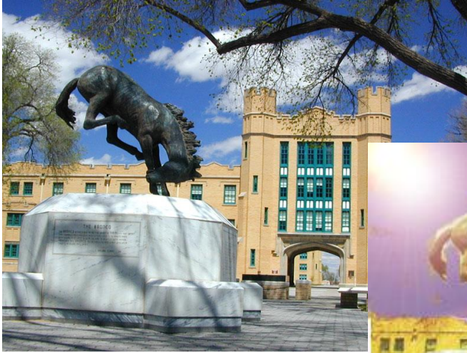
New Mexico Military Institute (NMMI – colloquially pronounced "Nimmy".) Founded in 1891

Area 3 Concept for the Desert environment.