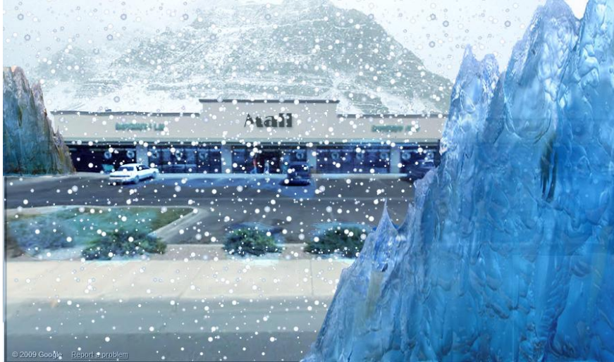
Area 2 Concept for the Arctic Tundra environment