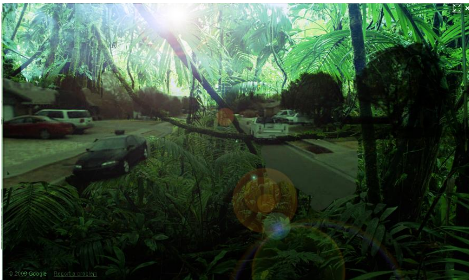
Area 3 Concept for the Rainforest/Jungle Environment