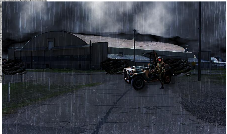
Area 6 Concept for the Alien Nest environment

Walker Air Force Base was the largest Strategic Air Command base of the US Air Force at the time of its closure in 1967.