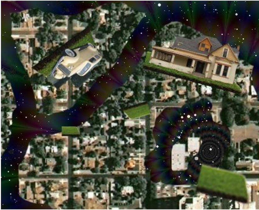
Area 5 Concept for the Zero Gravity environment